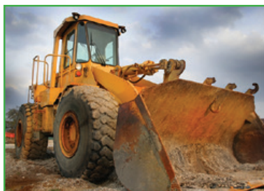
Construction – Heavy Equipment