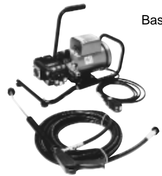
Basic Hand Carry